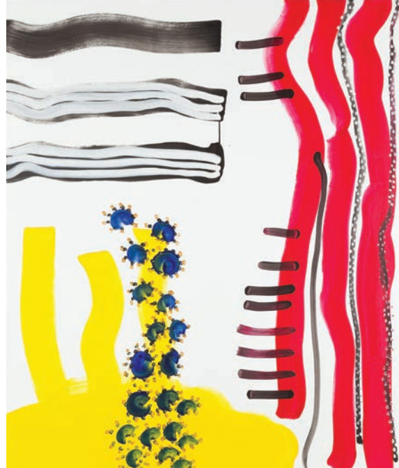
↑ Monk Time #4 , 2013 Acrylic on linen 216 x 183 cm