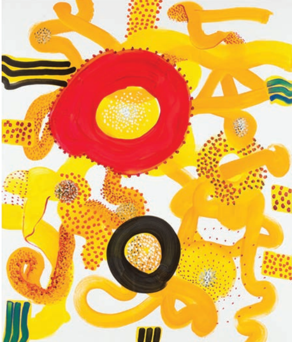
↑ Monk Time #3 , 2013 Acrylic on linen 216 x 183 cm