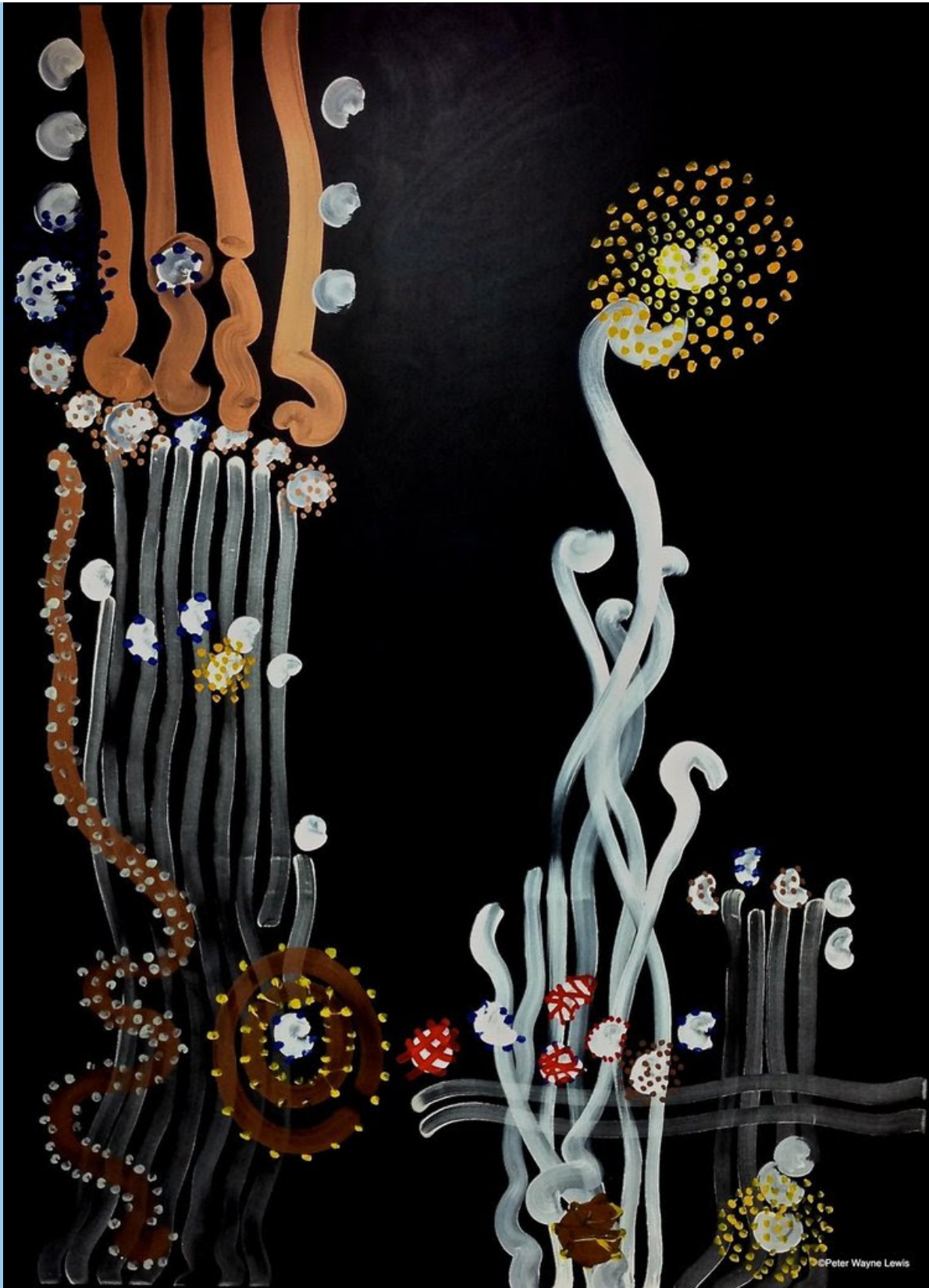
Brain Dance , 2014