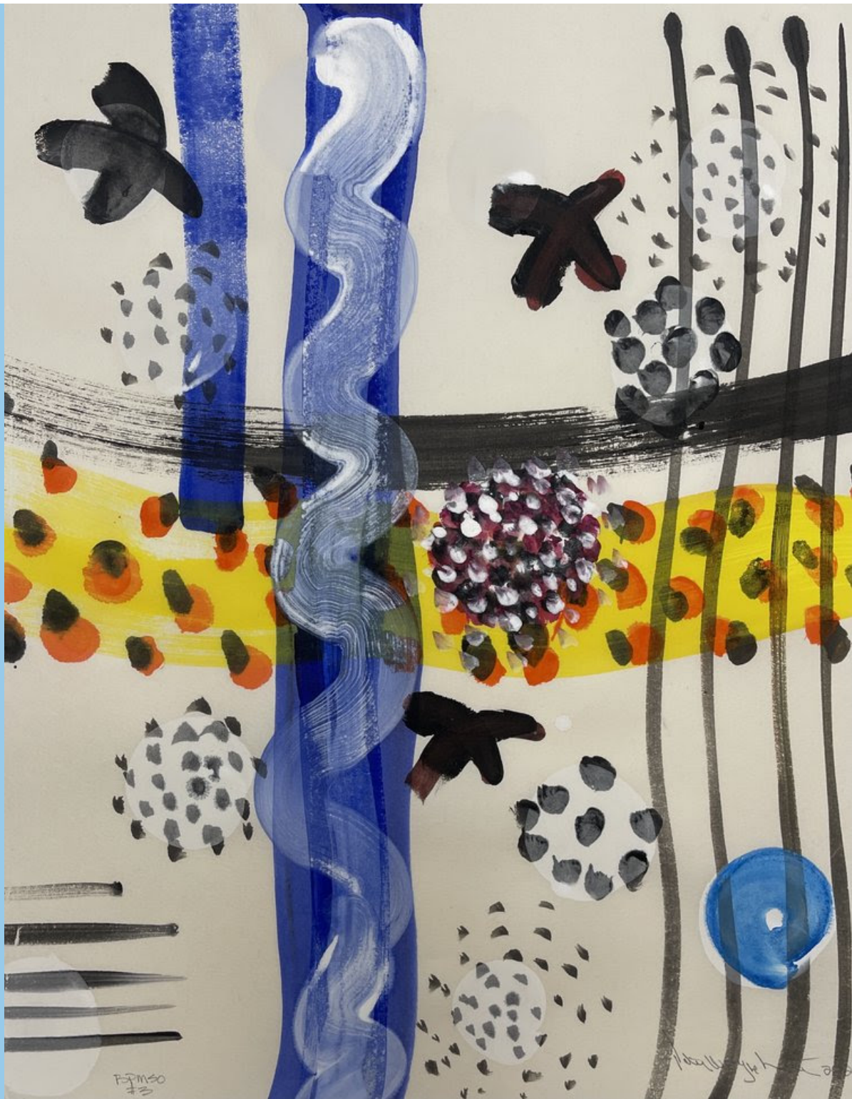
Buddha Plays Monk South Orange Suite 3, 2021