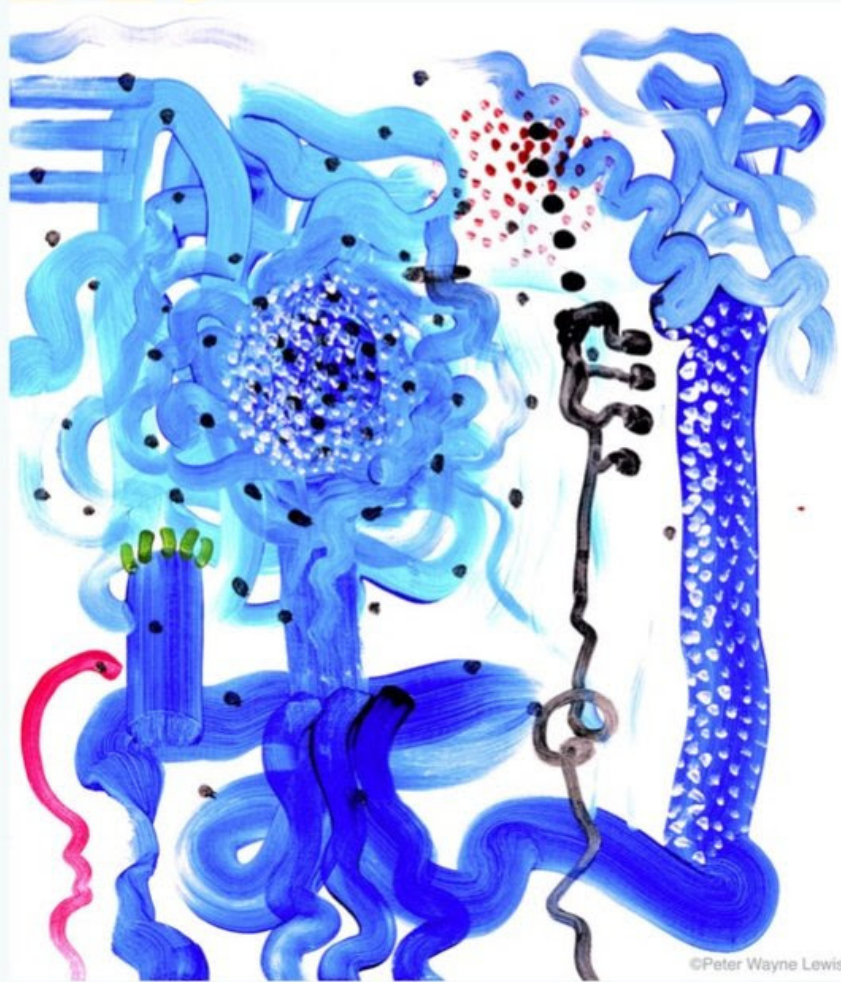
Buddha Plays Monk Suite #6, 2012